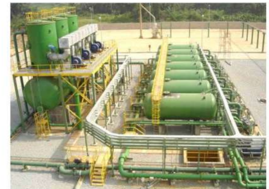
Filtration System at Power Plant