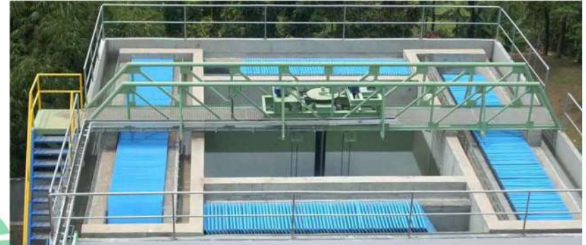
Ultra High Rate Clarifier for Textile Plant

Our comprehensive solutions extend from influent water through potable & process water, effluent treatment, water reuse & zero discharge and waste-to-energy projects. We take great pride in providing 24x7 support service that ensures high performance continuity.