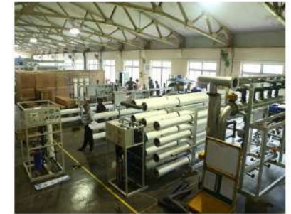
Fabrication & Assembly Facility at Verna, Goa