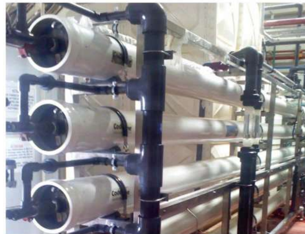
Reverse Osmosis Plant at Food & Beverage Industry