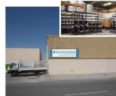
Assembly Unit at Sharjah, UAE