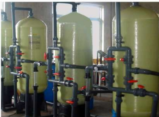
Arsenic Removal Plant for Ground Water Treatment