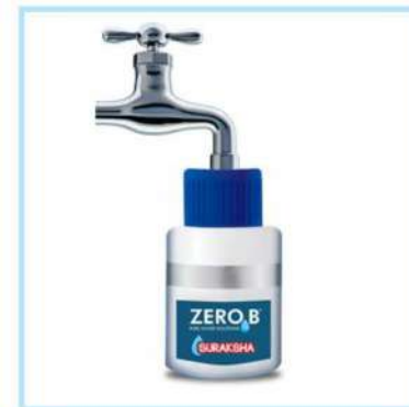
Zero B Suraksha Tap Attachment