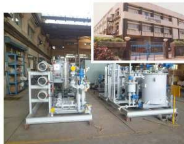
Export Oriented Unit at Rabale, Maharashtra