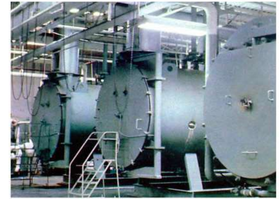
Boiler Water Treatment

Water quality monitoring products ensure accurate analysis of water, essential for maintenance of boilers, cooling towers, softeners and demineralisers. These are available as individual outfits, combination kits and refills.