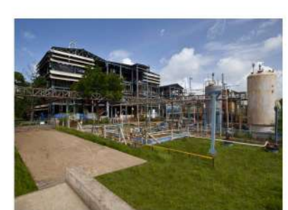
Resins Manufacturing Unit at Ankleshwar, Gujarat