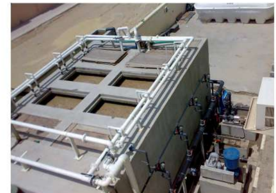
Membrane Bioreactor at Commercial Complex