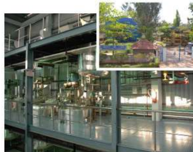
Industrial Chemical Division at Patancheru, Telangana