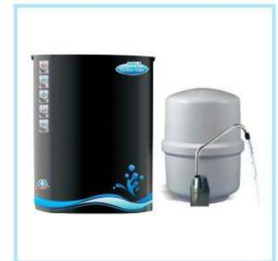
Zero B Kitchen Mate