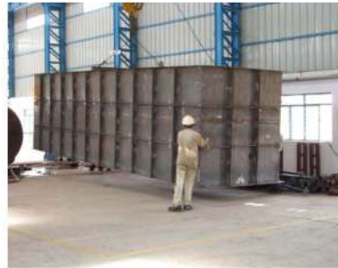
Fabrication & Assembly Facility at Hosur, Tamil Nadu