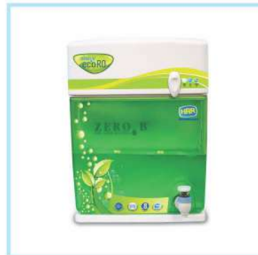
Zero B eco RO