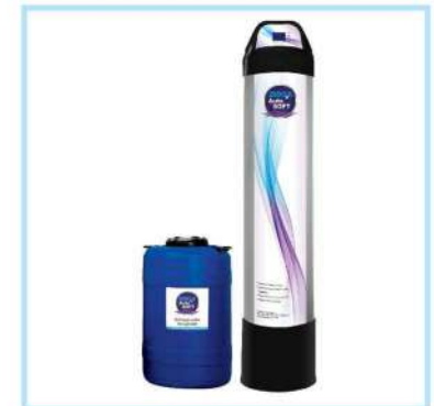
Zero B Softener