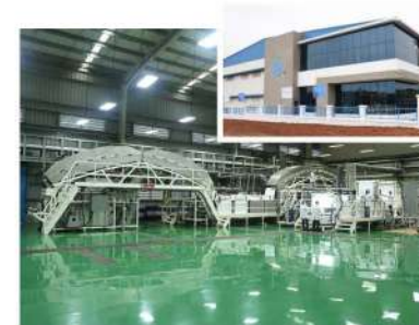
Membrane Manufacturing Unit at Verna, Goa