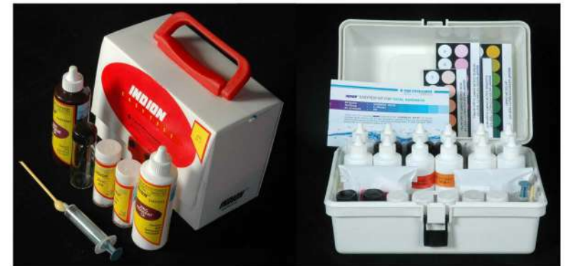
Water Test Kits and Refills