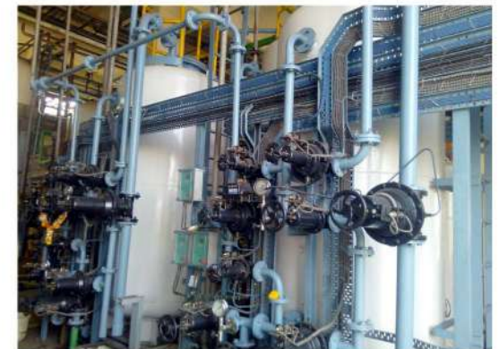
Glycol Purification for Chemical Plant