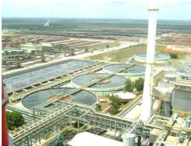
High Rate Solids Contact Clarifiers for Paper Industry

If we want a sustainable future for coming generations, there is a need to protect the environment and conserve natural resources. We help industries to use their water and energy resources more efficiently and provide solutions that address the needs of each customer. Through quantifiable benefits we have demonstrated time and again that efficient water and environment management is a value investment.