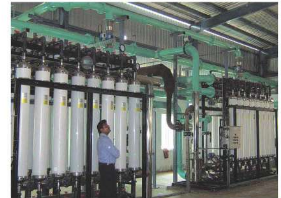
Ultra Filtration at Paper Industry