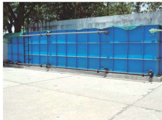
Fluidised Media Reactor at a Hotel