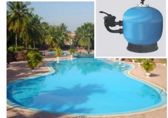
Swimming Pool Filters