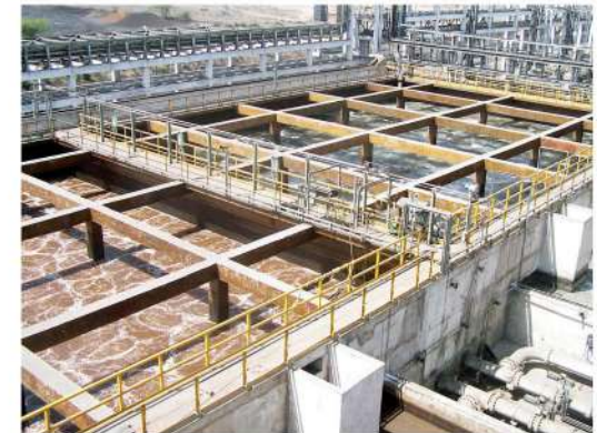
Effluent Treatment Plant at Refinery

Solutions integrate physicochemical, biological and membrane separation processes for optimum water recovery. These include micro filtration, ultra filtration, nano filtration and reverse osmosis systems, membrane bioreactors and advanced photochemical oxidation.