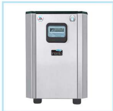
Zero B Intello