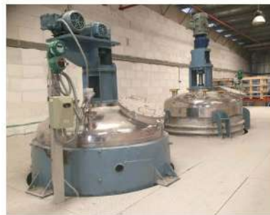
Chemical Blending Plant at Bahrain