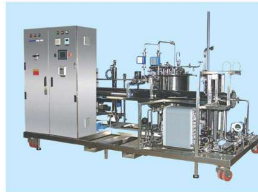
Reverse Osmosis (RO) Electrodeionisation (EDI) for Pharmaceutical and Electronics Industries