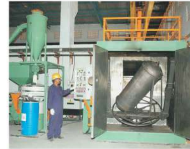
Fabrication Plant at Wada, Maharashtra