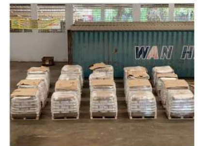
Warehouse & Assembly Centre at Indonesia