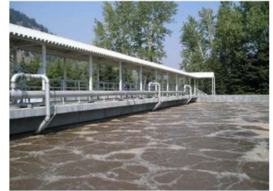
Drinking Water Treatment for Municipality

Our wide range of solutions for surface and ground water treatment remove pollutants ranging from simple silt to contaminants such as arsenic, fluoride, iron, nitrate, organics and salinity. We undertake turnkey projects on EPC or BOO/T basis for water supply and distribution, drinking water treatment, sewage treatment and disposal, sea water intake and desalination, solid waste management and waste-to-energy projects - all backed by operation and maintenance services for continuous, optimum performance.