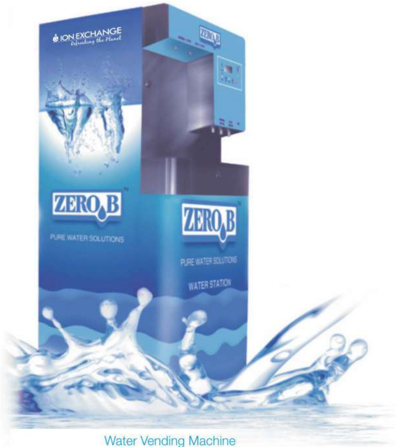
Water Vending Machine

We offer systems for drinking water purification, swimming pool filtration, disinfection, water conditioning for utilities, treatment of sewage and recycle.