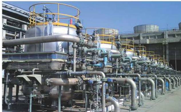
Demineralisation Plant at Petroleum Industry