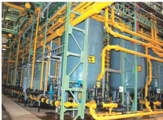
Uranium Recovery Plant at Mining Industry