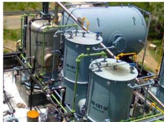
Boron Enrichment Plant for Heavy Water Board