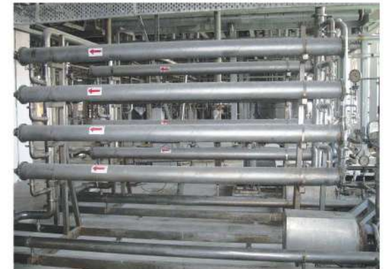
Gelatine Concentration Ultra Purification Unit in Food and Beverage Industry

Speciality process chemicals for the sugar, paper, ceramics, oil refining, mining, steel and textile industries help to increase efficiencies and product quality.