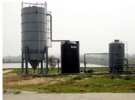
Continuous Sand Filter for Surface Water Treatment