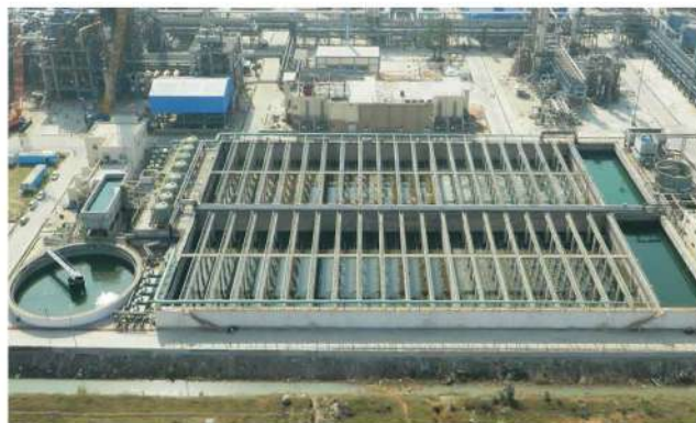
Effluent Treatment Plant for Steel Industry