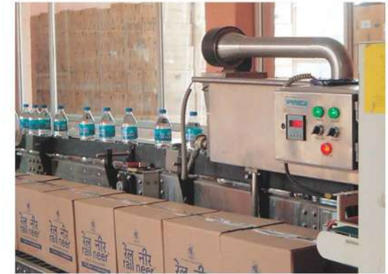
Packaged Drinking Water Plant for Railways