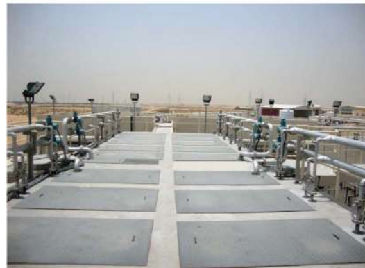
Membrane Bioreactor Plant at Industrial Area