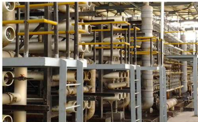
Sea Water Reverse Osmosis (Desalination) at Thermal Power Station