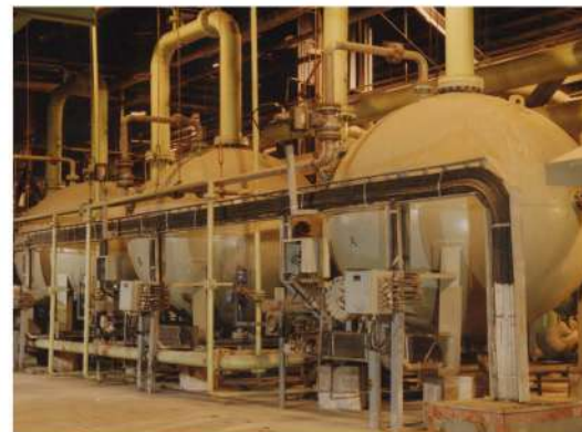
Condensate Polishing Units for Power Plant