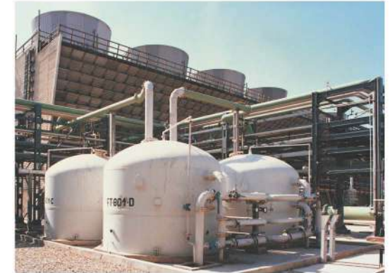
Cooling Water Treatment