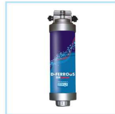
Zero B Iron Remover