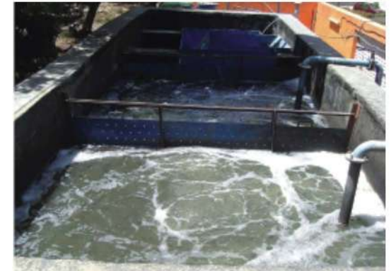
Fluidised Media Reactor for Sewage Treatment & Water Recycle