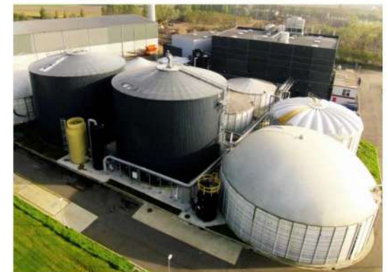
Sludge Digestion - Waste-to-Energy