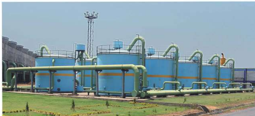
Side Stream Filters at Steel Facility