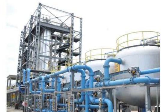
Zero Liquid Discharge System at Synthetic Rubber Plant