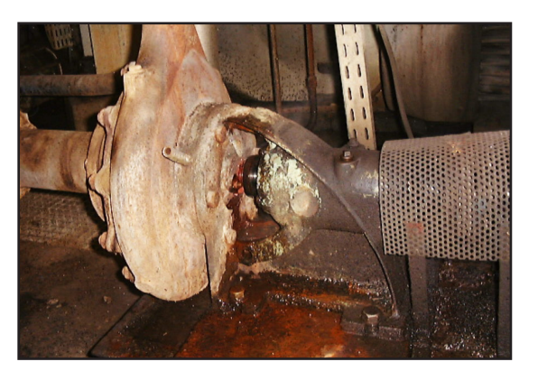
Condensate pump with Chesterton 180H Cartridge Seal.

Conventional mechanical seals were tested, but steam flashing through the seal faces caused face damage and eventual seal failure.